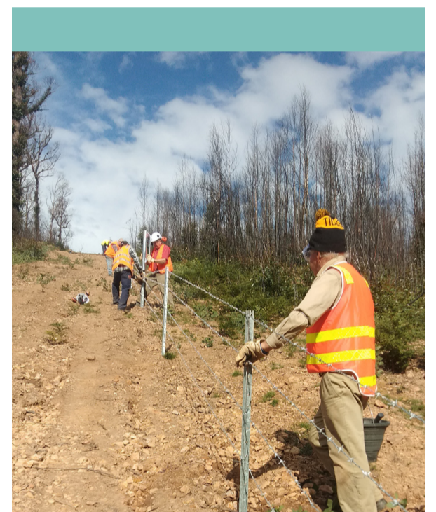
Rebuilding farm fences (Four Wheel Drive Victoria)